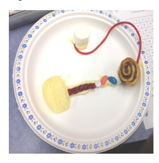
'The Edible Ear' Supply List

Have the teacher prepare items in baggies ahead of time. Each child will also require a paper plate. Per child: