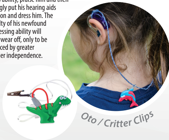
Oto / Critter Clips

Non-negotiable: Be persistent. Toddlers must learn that wearing hearing aids is non-negotiable.