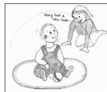
Figure 1. Get within the child's listening range.

Without parent buy-in, the manner in which the early amplification is fit to the child will not matter if the parent does not have sufficient intrinsic motivation to pursue the task of having the child utilize amplification consistently throughout each day. Similarly, parent groups have begun to send a strong message to hearing care professionals: Do not make decisions for our family and our child! Great resentment by parents has festered when audiologists, ENT physicians, or early intervention professionals have presented "final" decisions about communication options that are appropriate for a child based on his/her audiogram or the type of educational program convenient to the locale. Whether the influence has been toward sign language/manual communication or cochlear implantation, the message is clear: parents want information about communication options that they can then use to decide what feels right to their family dynamics, support system, and goals for their child. Providing parents with the names of other parents who have a child with hearing loss is a critical step for the audiologist and the early interventionist to include, as these relationships can become rich in emotional support and information at a time when parents of newly diagnosed children need it most.